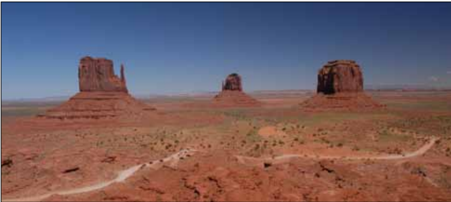
Monument Valley, Utah.

THE NEWSLETTER OF THE GLENS FALLS-SARATOGA CHAPTER OF THE ADIRONDACK MOUNTAIN CLUB