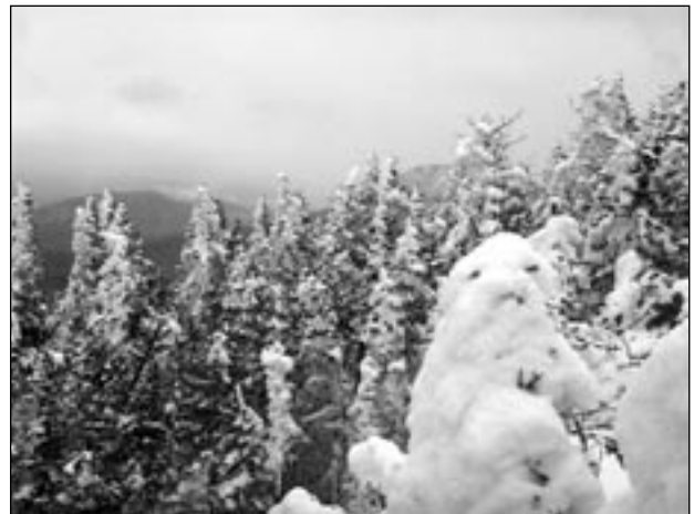
MOOSE & MCKENZIE — Limited views were available on the Moose and McKenzie outing on March 25.

• The last hike before the end of winter, decided to climb Whiteface via the Memorial Highway which turned out to be a windy way to go. Were able to walk 2 miles before we had to put on snowshoes and were quite cold by the time we reached the summit. On the way up, a snowmobile passed us on its way to the summit but had a hard time proceeding past the Esther junction due to the ice (lots of spinning and fishtailing). Since it was a cloudy day with no views, we quickly made our way back down to the junction with the trail heading over to Esther. The trail was broken out and in good condition with some patches of ice all the way to Esther's summit. We had spotted a car at the Atmospheric Science Center but on the way out missed the trail junction of Marble Mountain and ended up coming out at the reservoir — a 2-mile walk back up to our car. Participants: Eberhard Burkowski, Pat Desbiens, Kerry Shea, Jack Whitney