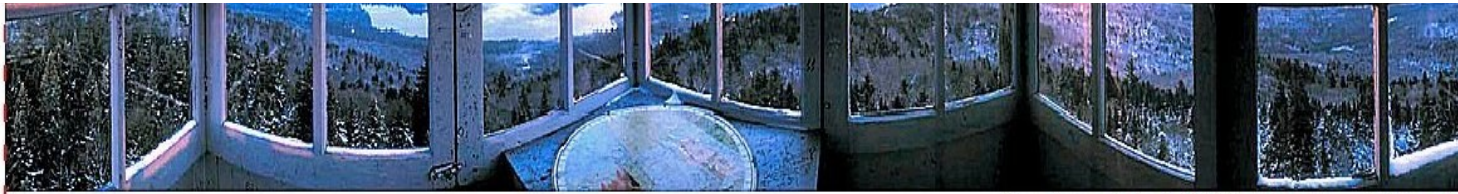
Above: fire tower In the cab of Bald Mountain tower Carl Heilman II Cover: Sunrise from Hurricane Mt.