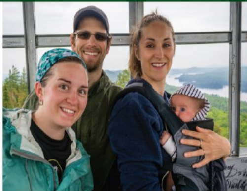
In the cab of Bald Mountain tower

Enthusiasm for the ADK Fire Tower Challenge burgeoned in the years following its creation, prompting the Glens Falls-Saratoga Chapter to introduce the ADK Winter Fire