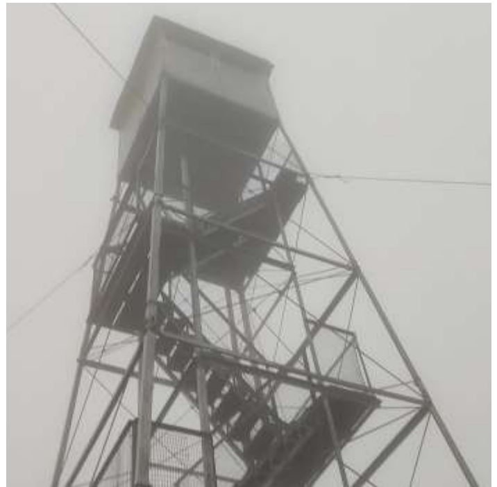
Hadley Sunset Hike, without the view.