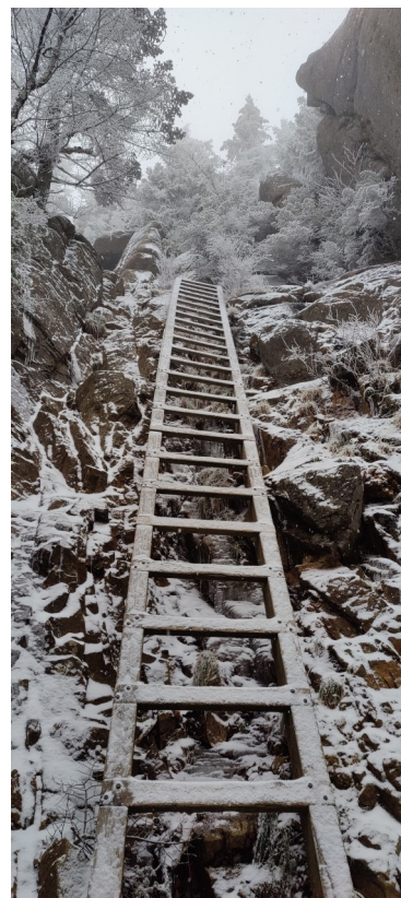
Ladder to Crane