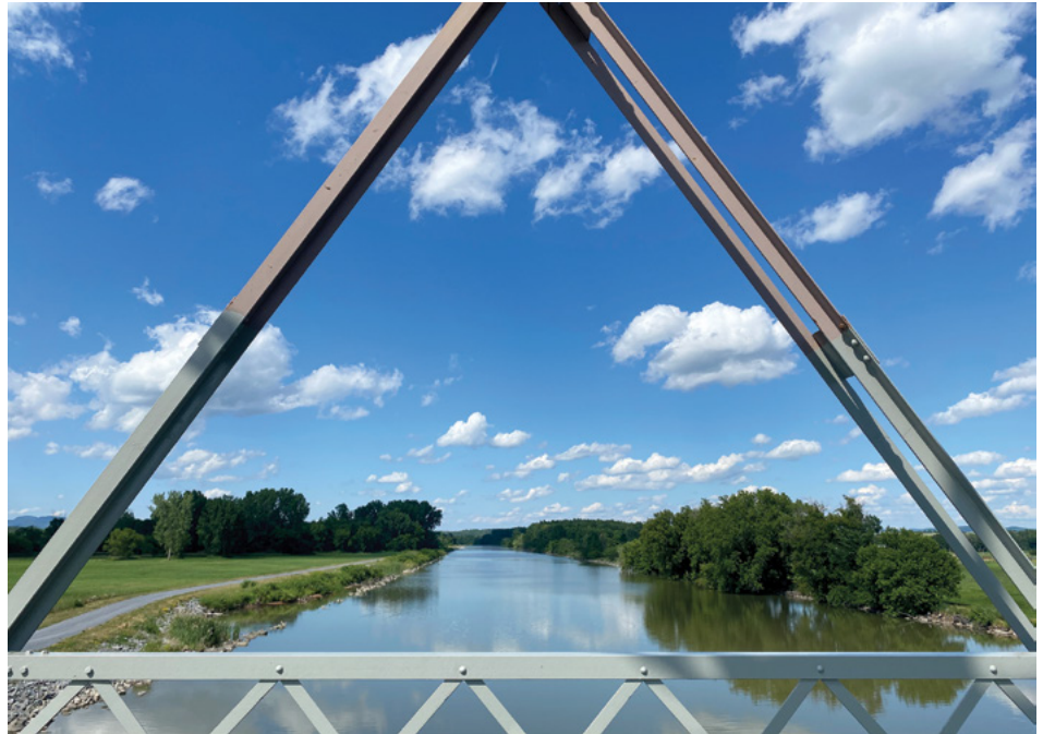
WE'VE GOT SEVERAL UPCOMING BIKING OUTINGS. WE HOPE YOU'LL JOIN US FOR ONE.

I'm going to make a couple small changes, since I first wrote this (I recently biked it). I'm going to go the other direction, counterclockwise. We'll take Grange Hall Road into Schuylerville, and visit the Saratoga Monument for a short while. These roads have less traffic and a better shoulder. This is basically following the Hudson River south on the west bank, then entering Schuylerville, and biking north on the east bank. In general there isn't much traffic, though we will be on Route 4 for a while, but it has a really nice wide shoulder. It also is part of the new Empire State (bicycle) Trail. We will meet at the Rogers Island visitor center. There is lots of good parking there. The total distance is about 25 miles. There are a few hills, but nothing too bad. We'll probably stop at Stewart's in Fort Edward or Schuylerville depending on the group's wishes.