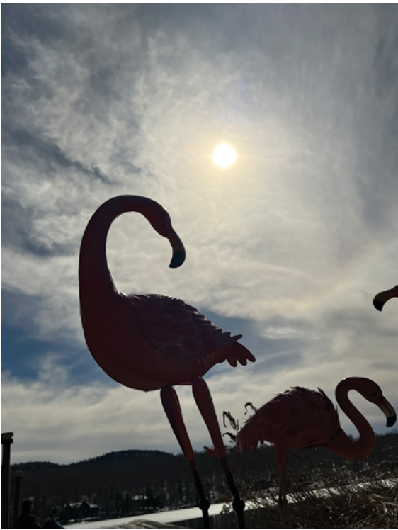
THE APRIL 8 TOTAL SOLAR ECLIPSE WAS A SPECTACULAR EVENT. WHETHER YOU WATCHED FROM YOUR BACKYARD OR TRAVELED TO POINTS FARTHER AFIELD, WE HOPE YOU GOT A CHANCE TO SEE IT SAFELY.