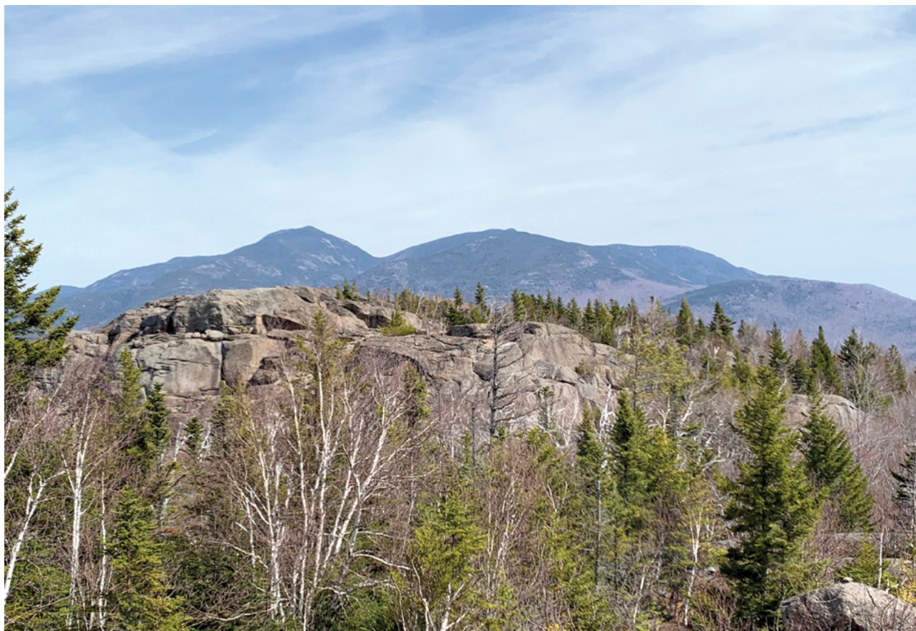
VIEW FROM SPOTTED MOUNTAIN.