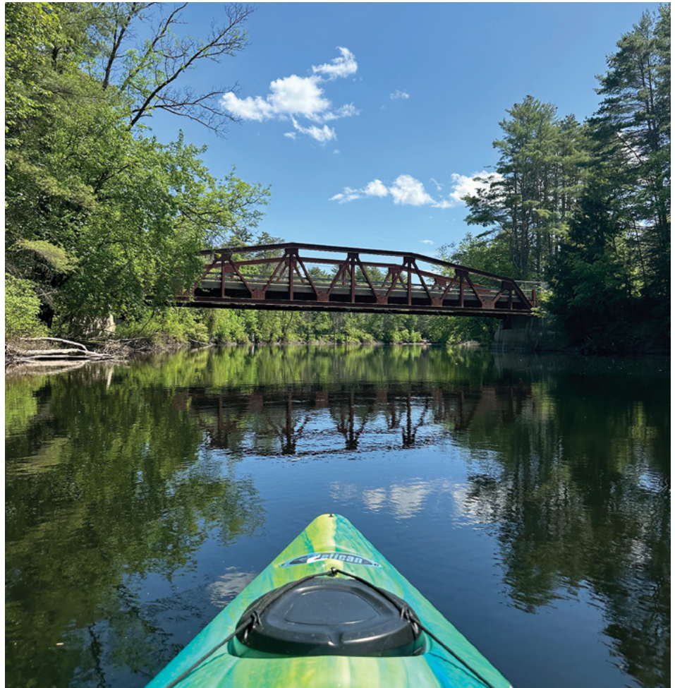
ITCHING TO GET ON THE WATER? THERE ARE SEVERAL UPCOMING OUTINGS THAT FEATURE PADDLING OR SWIMMING.

A wonderful, diverse hike along the shores of Lake George to Montcalm Point, where we will take a swim and then be picked up by boat and transported back to Bolton Landing. This 6-mile hike will be done at a leisurely pace to enjoy the scenery and wildlife and spectacular views of the lake. This hike is very limited so sign up early. We will meet in the public parking area at the south end of town, adjacent to the Bolton Brewery. Please be on time and arrive a little before 9 am.