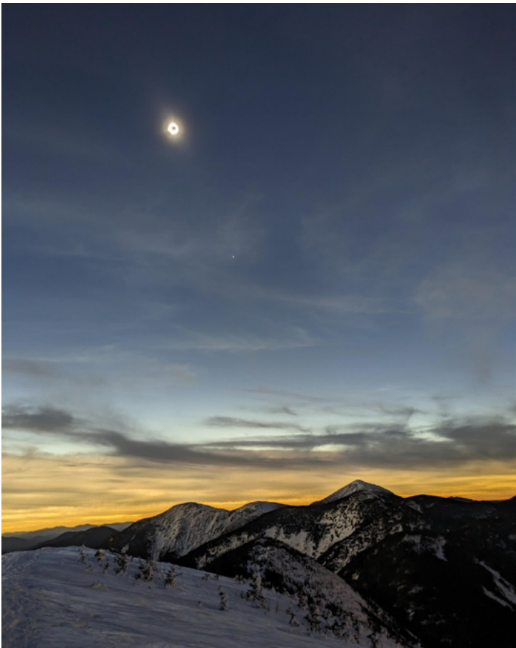
THE TOTAL ECLIPSE FROM THE SUMMIT OF GOTHICS. PLEASE SEE PAGE 7 FOR TRIP REVIEW.