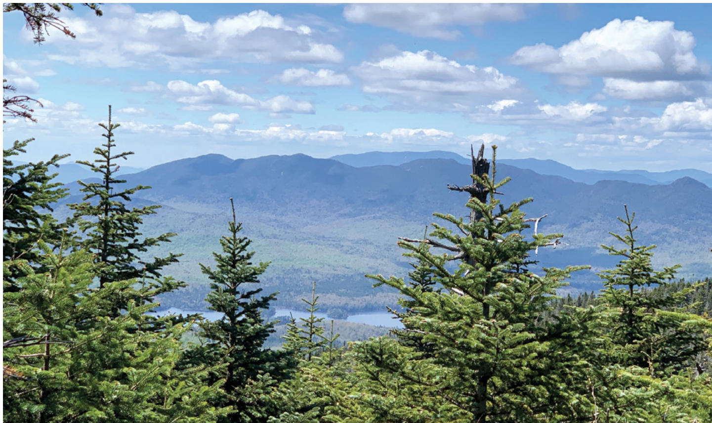
VIEW FROM BOREAS MOUNTAIN.

thanks to them, too). Special shoutout to Joe Paterson: He started several days early, and had almost all of the junk near the roadside from the eastern most dump. There were lots of big heavy things that had to come up a steep embankment. I think almost everyone was either associated with Glen Lake or the Queensbury Land Conservancy. Thanks again. The preserve looks great.