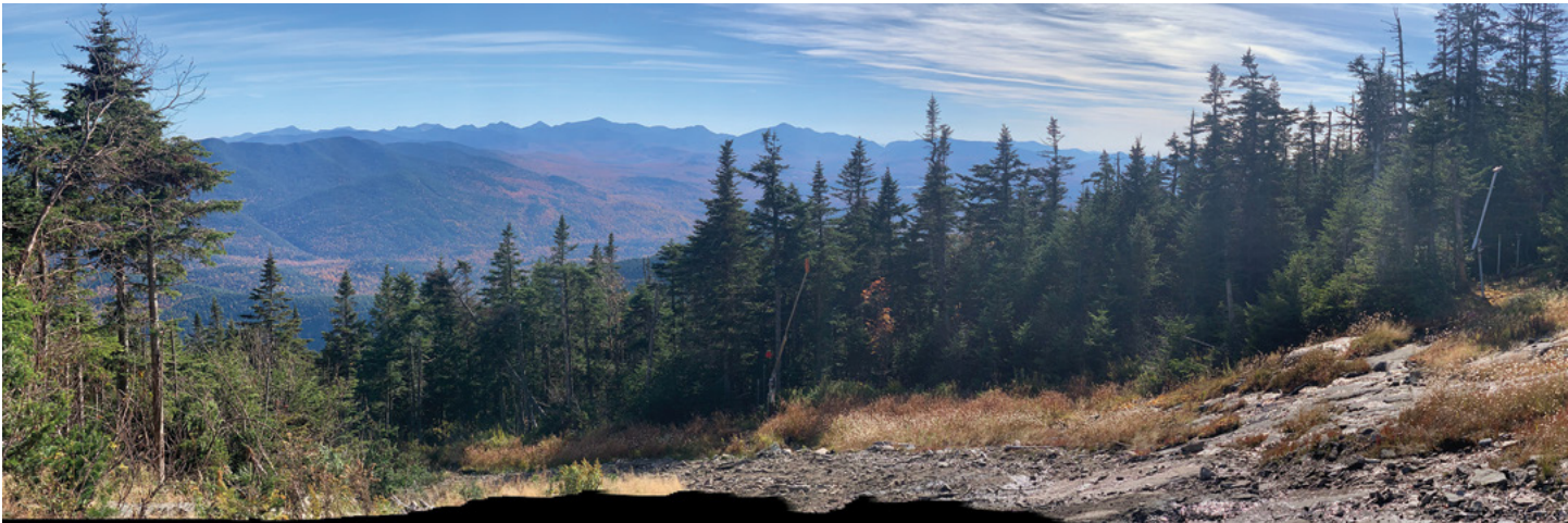
THE VIEW ATOP WHITEFACE MOUNTAIN, OCTOBER 6.