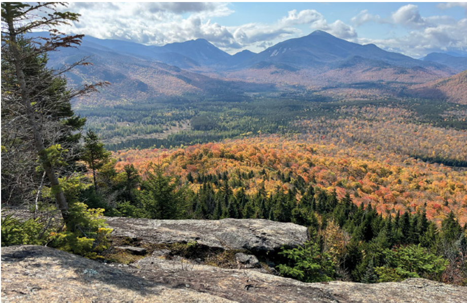
LOOKING AT COLDEN, AVALANCHE, AND ALGONQUIN (LEFT TO RIGHT) FROM MT. VAN HOEVENBERG, OCTOBER 7.