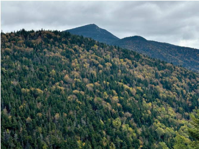
THE VIEW FROM HOPKINS MOUNTAIN, SEPTEMBER 24.