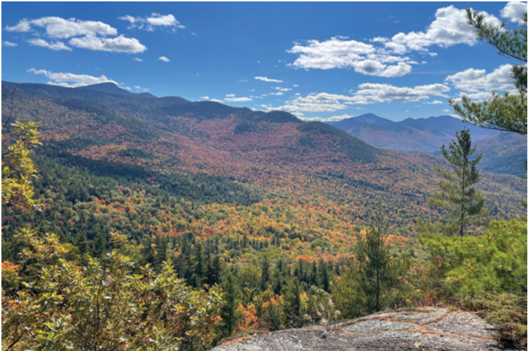
THE VIEW FROM BAXTER MOUNTAIN, WEEKEND OF OCT. 5.