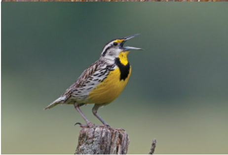
ABOVE: SHORT-EARED OWL LEFT: EASTERN MEADOWLARK