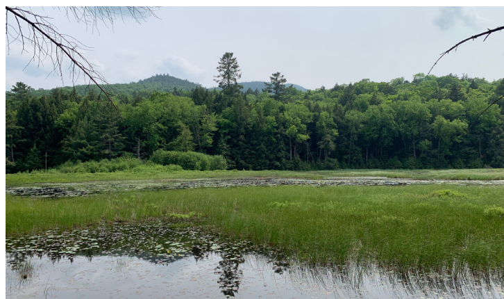
Photos from 6/8 outing to Pharoah Mountain.

humid day with plenty of blue skies. Spier Falls Road was a challenge, but we made it up the major climbs with no difficulties and stopped a few times to enjoy views of the Hudson. We took a break at (one of) the Stewart's in Corinth for cold drinks and ice cream sandwiches before riding on to Lake Luzerne, where we paused near the library to enjoy some shade and more views of the river. Before checking in at the Lake Luzerne state campground, we ducked into Harris Grocery for more provisions and a selfie with Elsie the Cow. There was plenty of time for a refreshing dip in Fourth Lake before dinner and the beach had lovely views of nearby Potash Mountain. In the morning, we managed to be out of the campground by 8AM. Corinth was bustling with people preparing for boating, river floats, and days at the beach. With the day heating up quickly, we took a direct route back and arrived at our cars before noon. Both days were a bit more than 30 miles of riding with about 2,000 feet of climbing on the first day and 1,000 feet on the second day. This was a great adventure and a fun experience mixing bikes and camping!